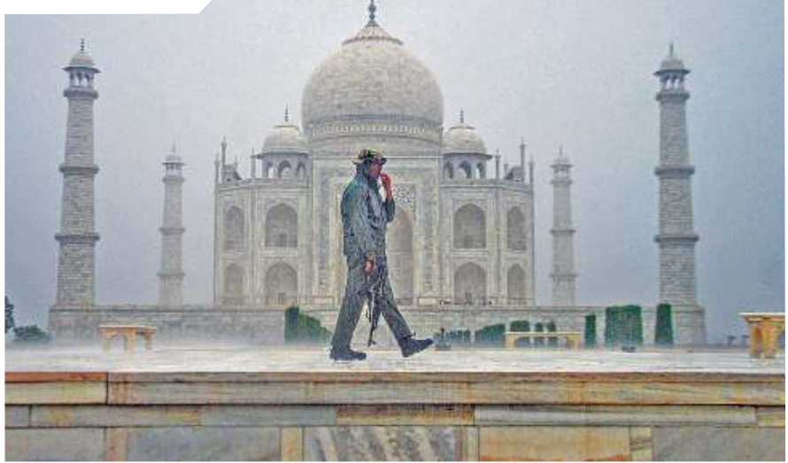
A security personnel keeps a vigil during monsoon rain at the Taj Mahal, in Agra