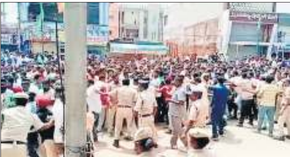
A few policemen persuading the rival groups to disperse in Gajwel town on Tuesday