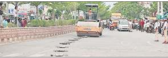
Noise-polluting silences being crushed by a road roller in Siricilla on Tuesday